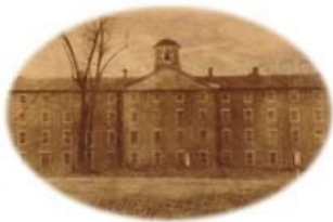
Original College building at Boydton, VA, prior to the College's move to Ashland after the Civil War